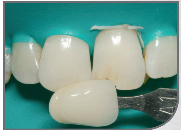
Shade check against Vita Shade tab that is keyed to the cured composite shades.