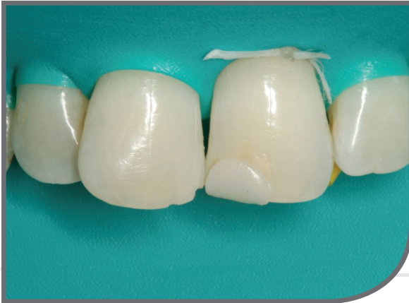
Composite resin placed to check for correct shade.