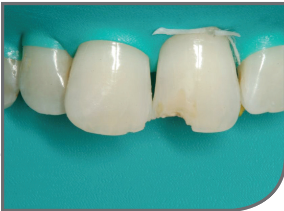
Rubber dam isolation of fractured tooth.