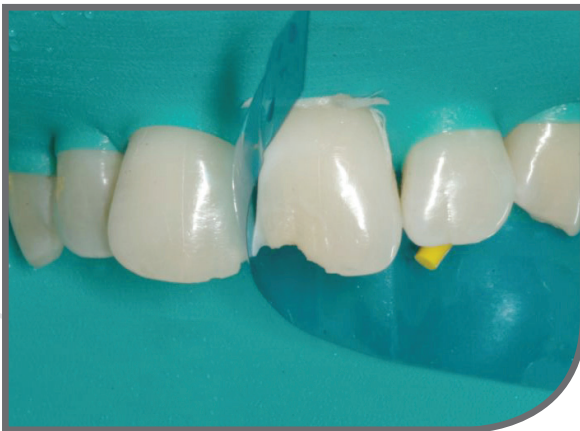
Garrison Dental VariStrip placed interproximally.