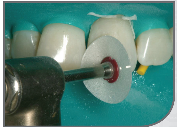
The restoration is contoured using discs and diamonds.