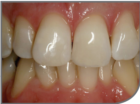
Final post-op restoration immediately after placement.