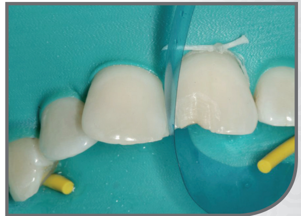
VariStrip is precontoured to facilitate a more natural interproximal contour.