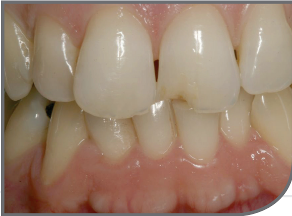
Pre-operative view of fractured incisal edge corner of maxillary left central incisor.