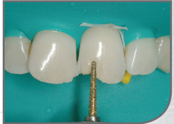
Long bevel placed into the enamel to increase surface area for bonding and also to allow better blend of a translucent resin at the tooth-restoration interface.