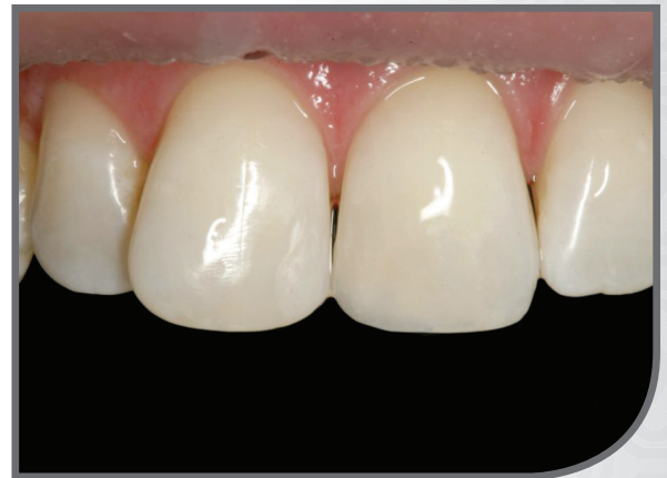
Final post-op restoration immediately after placement.