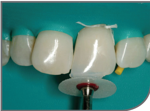
The restoration is contoured using discs and diamonds.