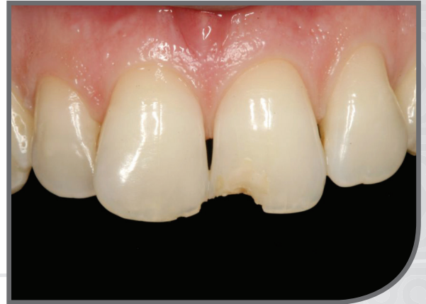
Pre-operative view of fractured incisal edge corner of maxillary left central incisor.