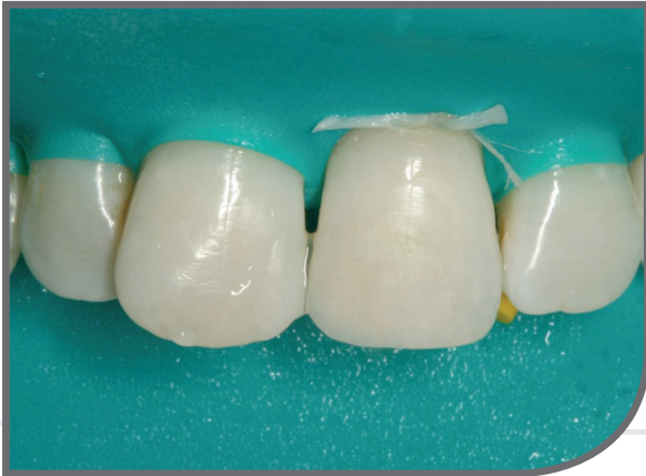
Restoration after initial gross shaping.