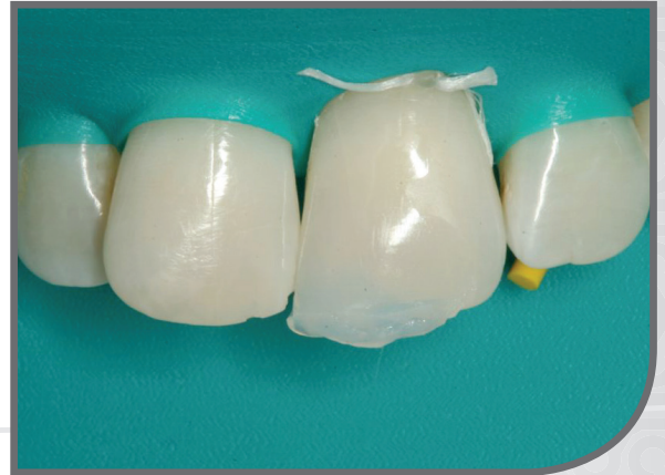
After light curing the resin, the VariStrip is removed.