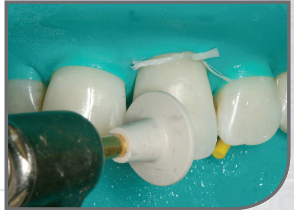
Restoration is then polished using rubber polishing points, cups, and discs.