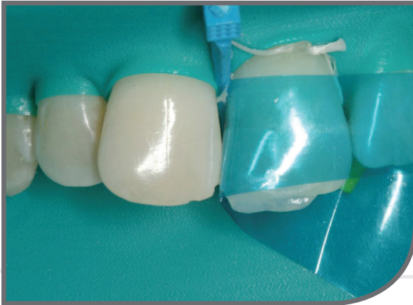
The VariStrip can be manipulated to reproduce the adjacent line angle since it is pre-contoured.