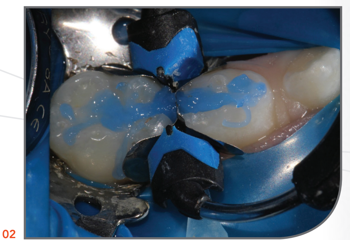
Phosphoric acid etch.