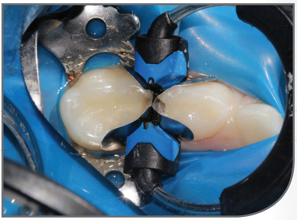
First and second primary molar MO/DO preparation and Garrison 3D XR Composi-Tight matrix system.