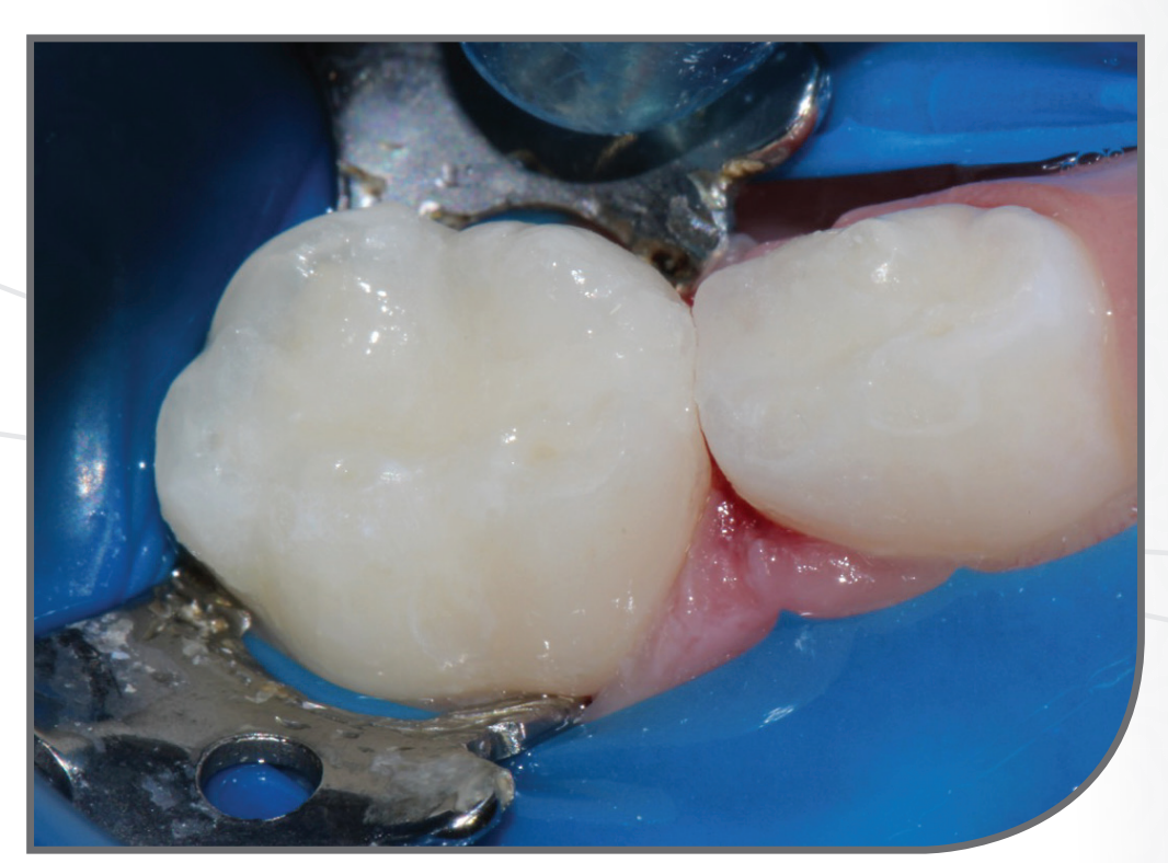
Use of composite instrument.