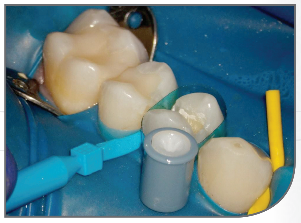
Use the handle of the Reel Matrix to position the matrix above the tooth and place it. Place the Wedge Wand to seal the gingival margins.