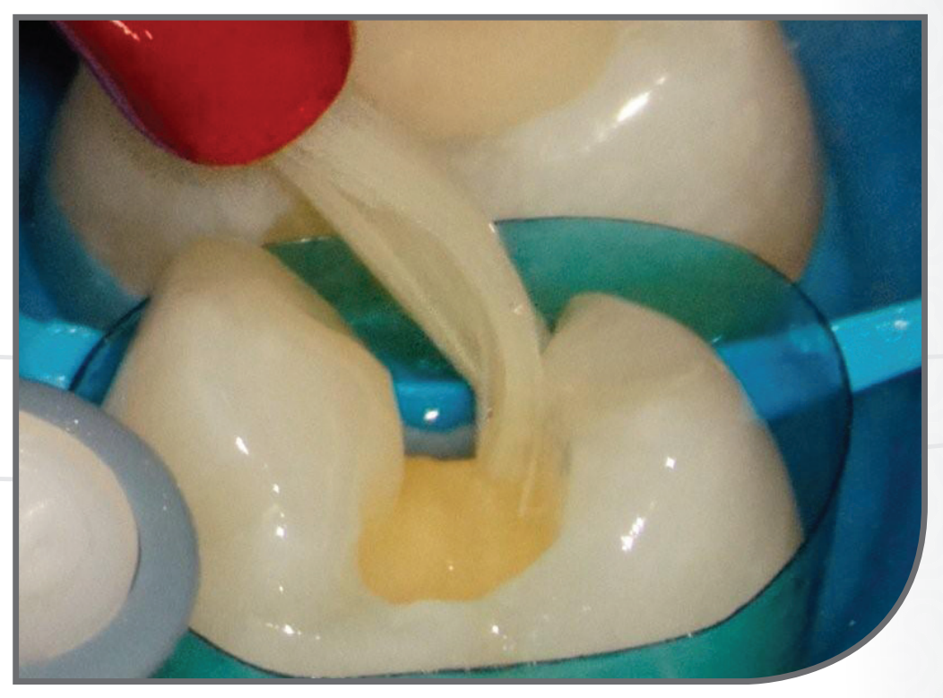
Brush on bonding agent Futurabond by Voco.