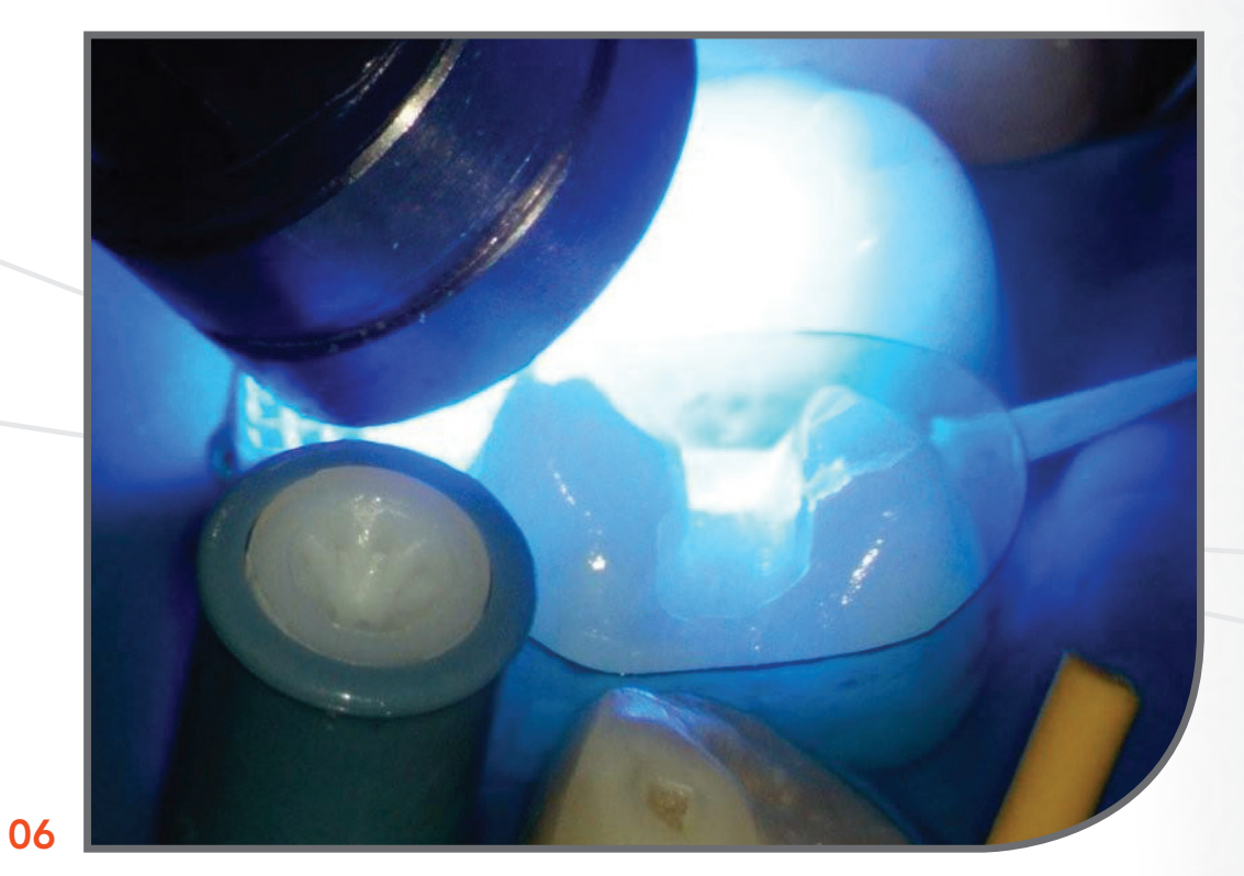
Cure bonding resin.