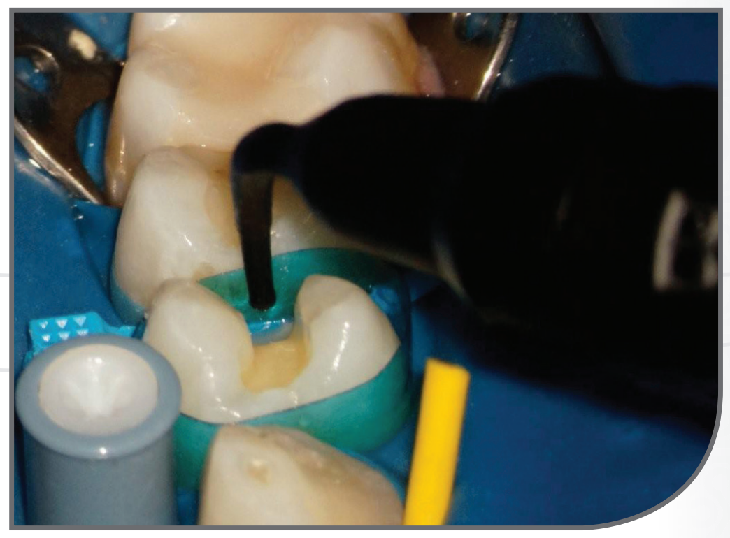
Place flowable composite G-aenial Universal Flo and cure.