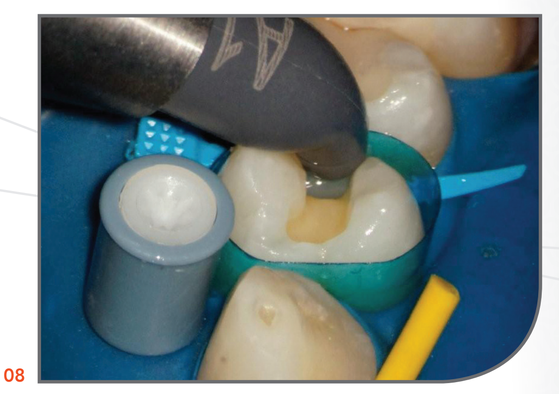
Place direct composite Venus by Heraeus and cure.