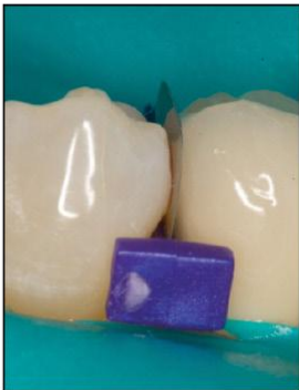
Figure 3 clearly shows marks from the bur along the shield. Much better to have those on the shield than on the adjacent tooth!

The plastic wedge—not just the metal shield—should firmly engage the interproximal surfaces of the teeth. This will provide the optimum pre-separation force and hold the FenderWedge securely in place. (Figures 1 and 2)