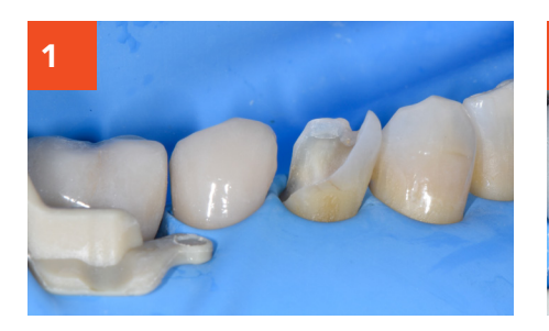
Clean cavity with deep cervical margin