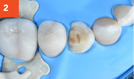
Occlusal view. Vital element