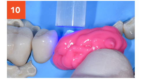
Silicone index to reconstruct the missing cusp