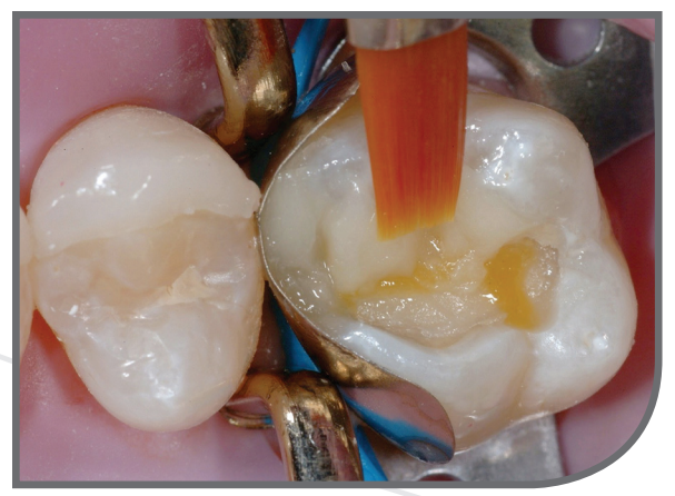
The buccal increment is placed using a composite placement instrument and refined with a #2 Keystone brush. Notice the anatomic placement of cuspal inclines and marginal ridge.