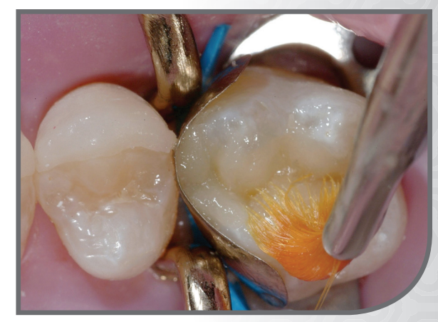
The palatal increment is smoothed toward the margin with the #2 Keystone brush. Note the anatomic placement of the marginal ridge into facial and palatal increments.