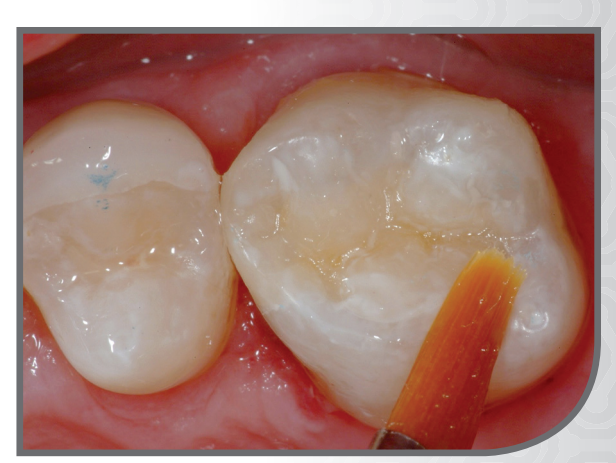
Application of surface sealant using a #2 Keystone brush.