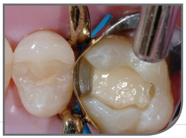
The solvent (ethanol) is evaporated with a stream of air across the cavity preparation.