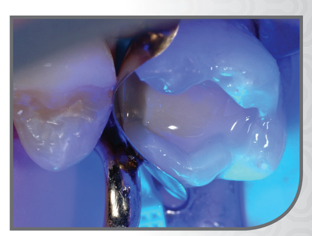
The flowable layer is light cured for 20 seconds.