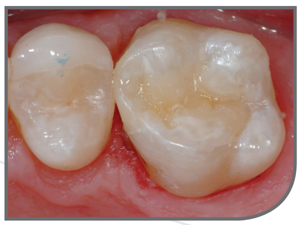
An occlusal view of the completed restoration after rubber dam removal prior to placement of the surface sealant.