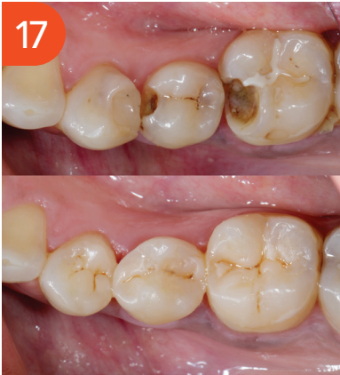
Before and after the treatment.