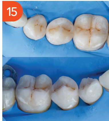
After completion of morphological layering on tooth #45, air abrasion with sodium bicarbonate was used to remove the smear layer.