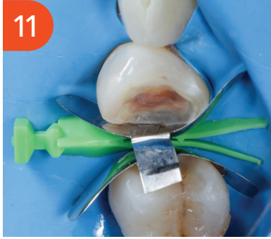
Both bands, FXH175, are secured with Quad large wedge ensuring tight seal.

Now it is time to restore teeth #44 and #45. Here is real test of matrix system and skill comes into the picture. Due to large defect and wider interdental space, we decided to restore one by one. Bands and wedge are secured as described previously.