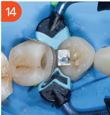
Band is removed from tooth #44 and the wall of tooth #45 is built up.