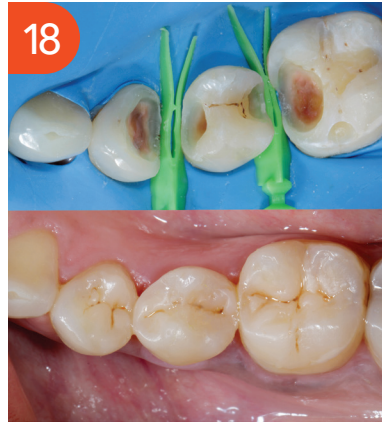
Showing how large defects were built in natural form and function.