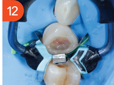
The procedure for placing the ring and following the layering protocol is repeated as described earlier. Quad ring is placed and creating the wall of tooth #44 is completed. The ring is removed along with the band and morphological layering is completed on tooth #44. The ring is again placed and burnished little on adjacent tooth to ensure tight contact post removal of the band. The procedure of making the wall is performed as described earlier.