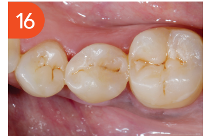
Post op 5 days shows close to natural morphology, contours and contacts.